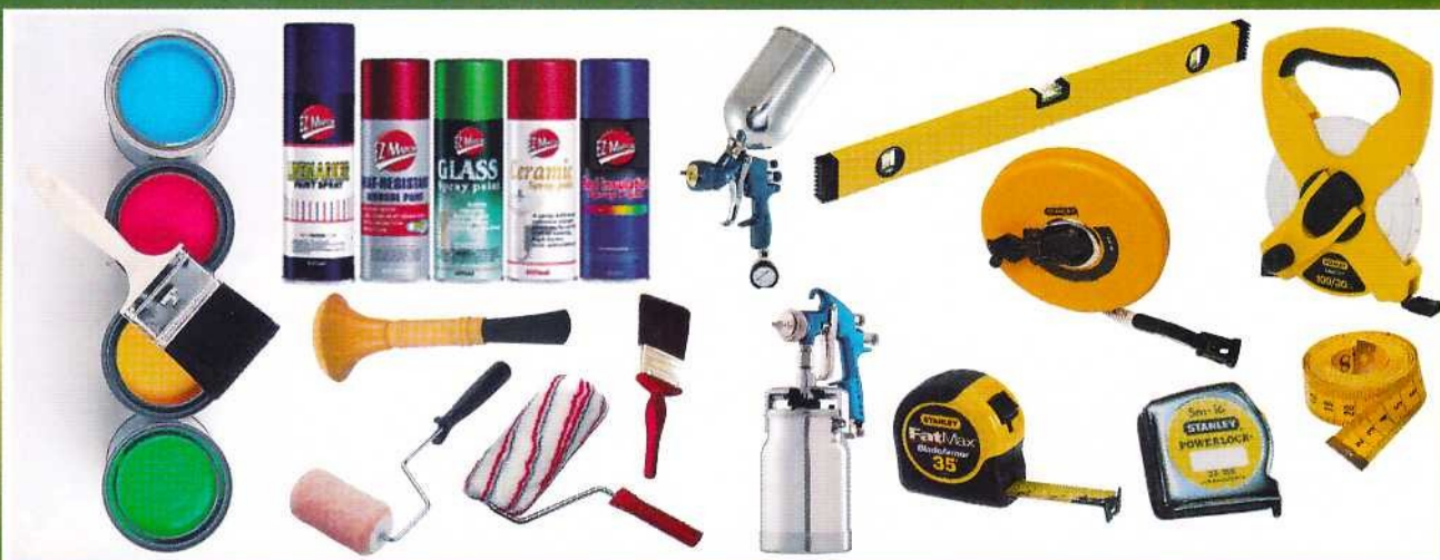
Roller, Brush, Spray Paint, Spray Gun, Thinner & etc... Measuring Tape like 100mtr, 50mtr, 5mtr, 7.5mtr, 10mtr, 3mtr, etc...