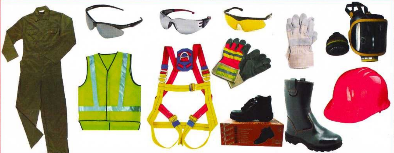
Helmet, Coverall, Safety Shoe, Goggles, Jacket & Mask