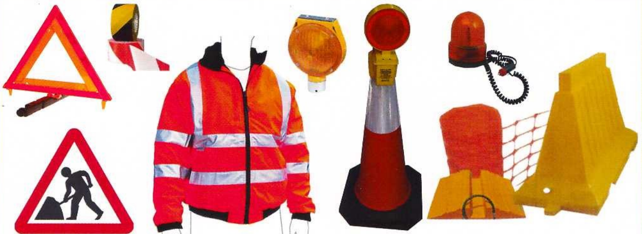
Safety Cone, Lights, All type of Barriers, Etc...