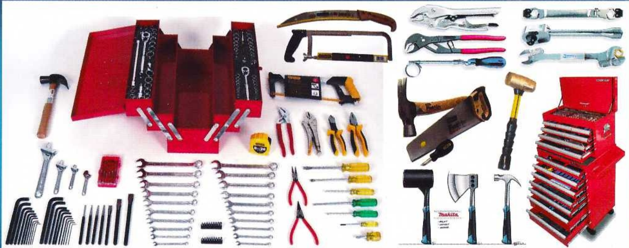
Spanner, Screwdriver, Handsaw, Hacksaw, tester, side cutter, Nose Plier