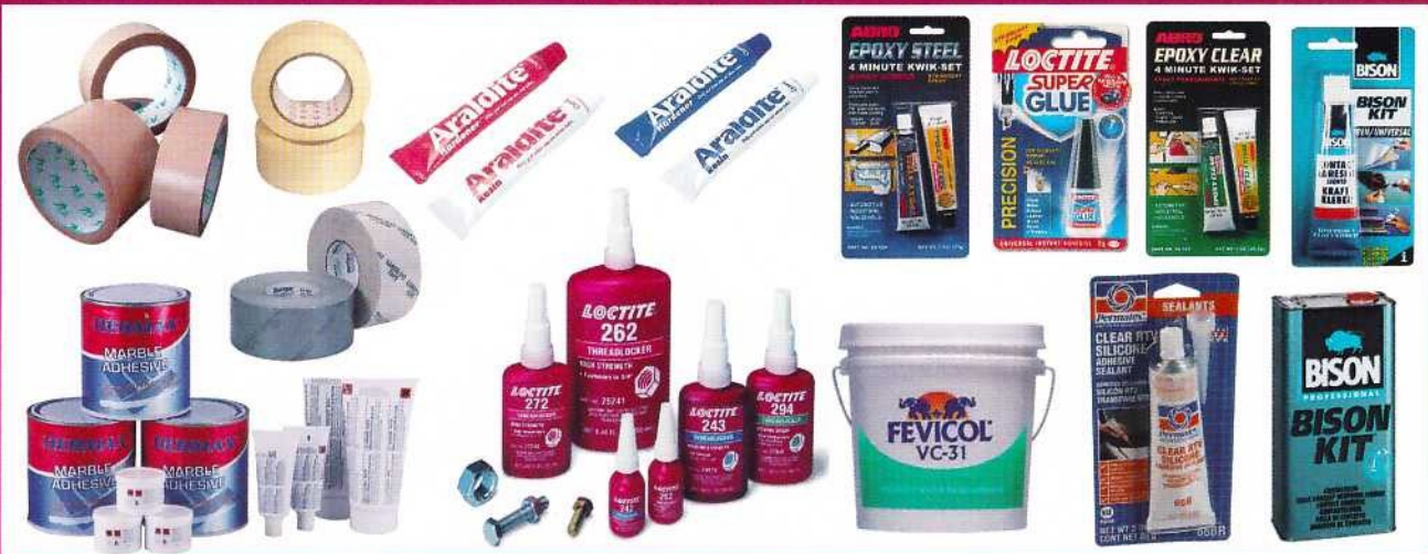
Loctite, Araldite, Concrevice, Marble Glue, Bisonkit, Fevicol Tape Adhesive like Insulation tape, masking tape, duct tape, clean tape and gypsum tape